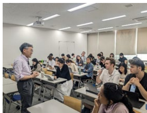
Interactive Classroom Scene

https://www.ls.keio.ac.jp/en/faculty.html